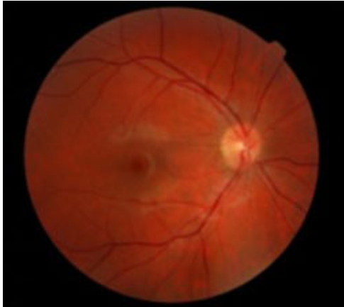
Fig. 1: Normal optic nerve.

What is the optic nerve? The optic nerve is a collection of more than a million nerve fibers that transmit visual signals from the eye to the brain [See Figure 1]. The optic nerve develops the first trimester of intrauterine life.