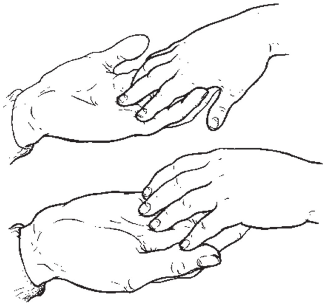
Figure 2. The teacher's hands are underneath—available for the child to use as tools.

Before a child learns to use her own hands as reliable tools, she will often trust and use the hands of another. Most people have seen a young child reach for an adult's hand and place it upon an object that she wants manipulated. In order for a child who is deafblind to be able to do this, the hands of the adult must be available for her to use. Without sight, the availability must be experienced tactually. I have found the most effective gesture is usually to place my hands, palms up, lightly under the child's hands, with my index fingers accessible for grasping. If a child has sight that she uses, the same gesture can be made in front of her. What is communicated in such a gesture, done again and again, is, "Here are my hands. Use them how you like. Explore what they can do." The adult's hands must remain free of tension, and pliable, in order for the child to use them as tools. Often the child will accept the offer, grasp my hands, experiment with moving them. Out of this simple gesture, many games and hand conversations can develop, and the child can gain confidence in her ability to use her own hands to affect the world.